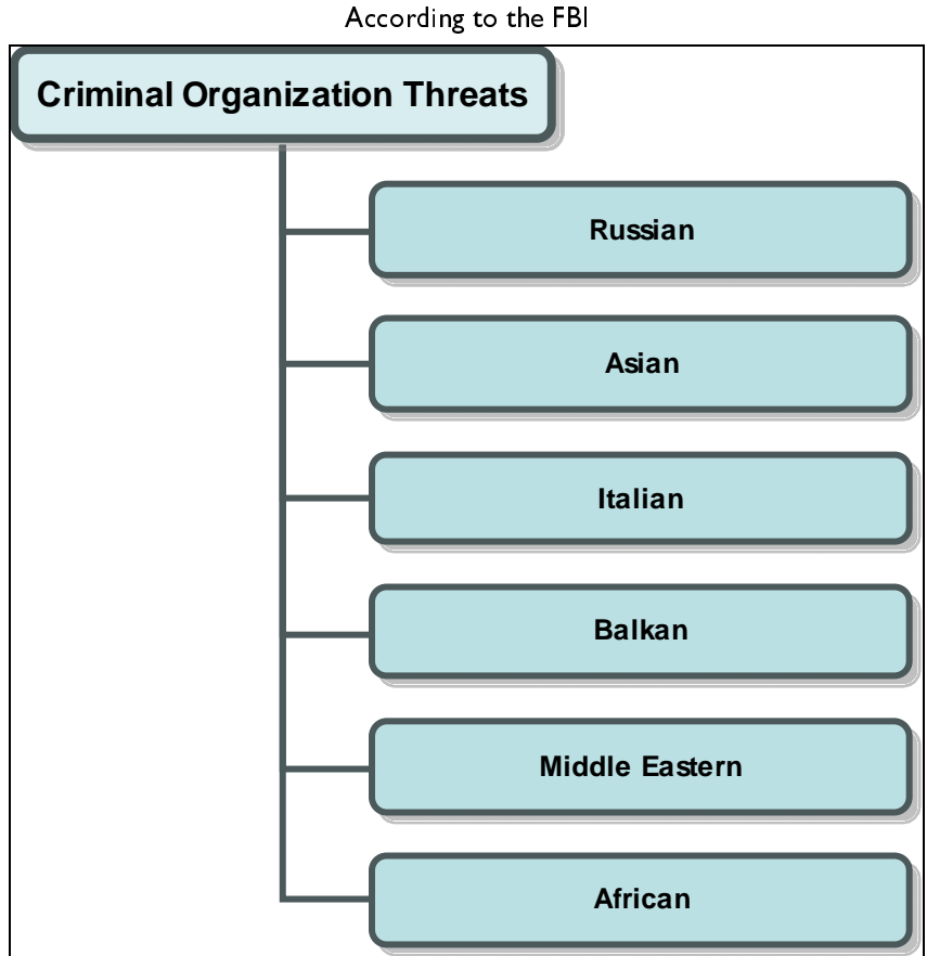
Figure 3. Organized Crime Threats in the United States

Although organized crime is popularly associated with the Italian Mafia, the breadth of organized crime in the United States includes many other criminal organizations. The FBI investigates organized crime groups that fall into three major categories: (1) La Cosa Nostra, Italian organized crime, and racketeering; (2) Eurasian/Middle Eastern organized crime; and (3) Asian and African criminal enterprises. Figure 3 outlines the top organized crime threats to the United States, as identified by the FBI. Threats to the United States posed by selected large-scale criminal organizations are discussed below.